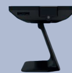
135 degree tilt angle