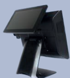
10.1" LCD USB customer display