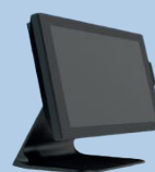
'No Bezel' true flat touch screen