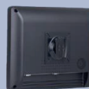
Wall mounting option