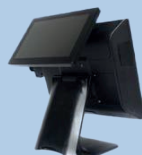
With 10.1" customer display