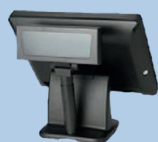
VFD 2x20 serial customer display