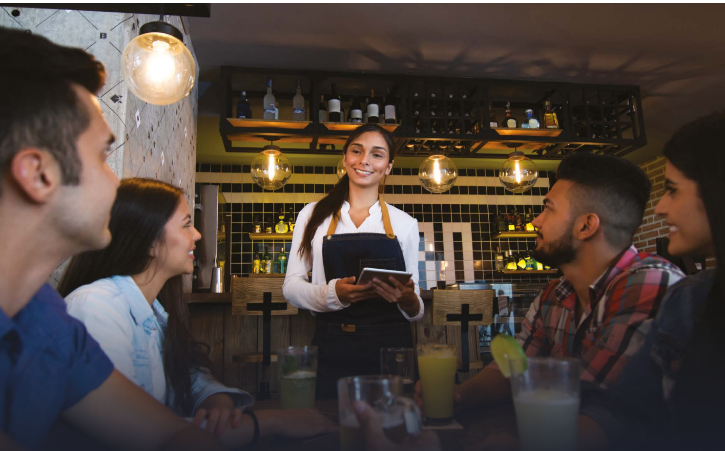
Table Management on the go.

Happy customers spend more, are more likely to visit again and bring their friends.