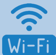
Onboard WiFi & Bluetooth