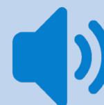
Onboard Sound with speaker