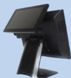
With 10.1" customer display