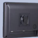
Wall mounting option