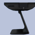
135 degree tilt angle