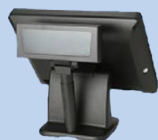
VFD 2x20 serial customer display